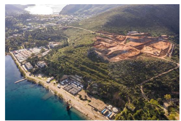
The construction site of the Leros camp seen from the sky in March 2021. Since then, rows of containers have been installed on the site to accommodate the migrants.

Those who manage to reach the Greek mainland have no less difficulty in integrating into society. Loïc is another Congolese man and had a bad experience with this. With his refugee status in his pocket, the young Congolese man in his twenties left the Lesbos camp in Moria last September to try to settle in the Athens area, without work and therefore no income, Loïc struggled to live.