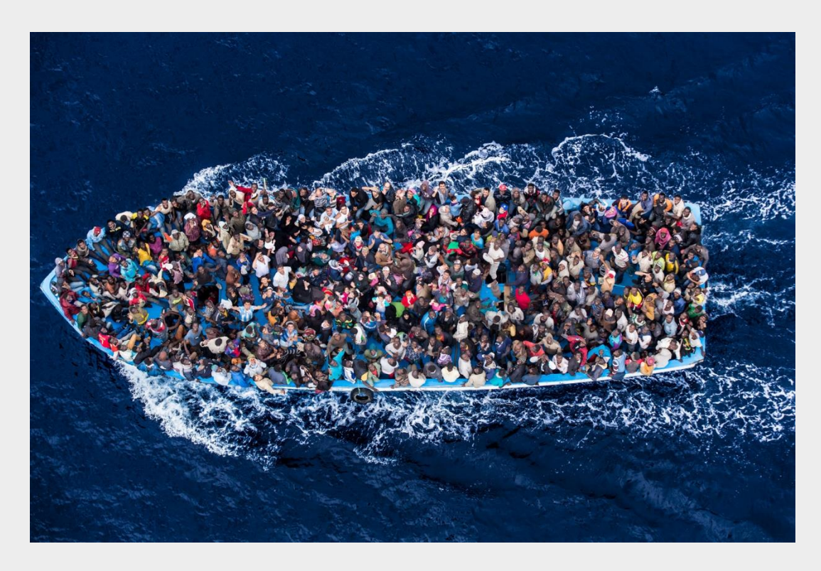
Italian navy rescues asylum seekers traveling by boat off the coast of Africa on the Mediterranean, 2014.

In Germany, he was in a refugee camp. He applied for asylum there and they told him to return to Italy. He was aware that Italy doesn't want him. He decided to try his luck in France. After a lot of attempts, he could pass the French borders. And he reached Paris. Now he is in France.