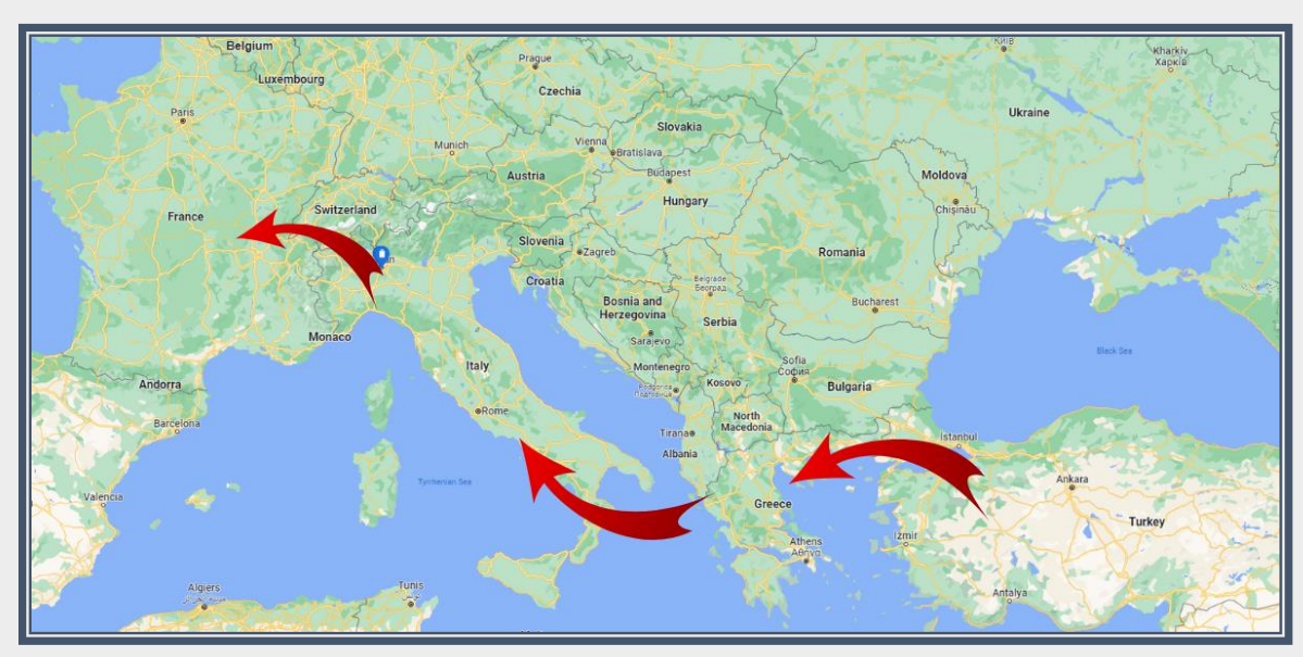
Kamran's Journey from Turkey to France

After a while, One truck came to take them. There were almost 50 people at the backward of the truck. There was no fresh air and some people were being beaten. They traveled for four and half hours, and then they started to walk again. They crossed huge snowy mountains on foot. They faced a lot of difficulties during the journey. Later another truck took them and they had to travel with this truck for 2-3 days. Finally, they arrived to Istanbul. Later Istanbul, they traveled through Greece, and Italy then France.