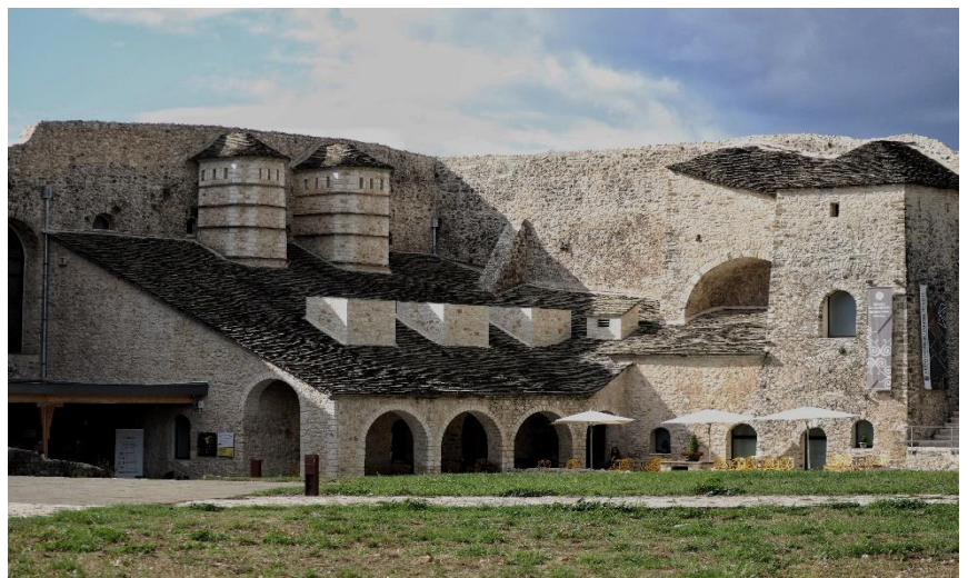
Silversmithing Museum - Μουσείο Αργυροτεχνίας

Today, it hosts a museum about the technology of silversmithing during the preindustrial period.