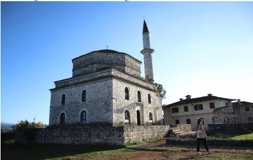
Fetiche Mosque - Φετιχέ Τζαμί

From 1913 until the end of XVIII e , the city was in the hands of the Ottomans. This domination gave rise to an interesting mix of cultures and merged into a combination of the Ottoman Empire and the Byzantine Empire.