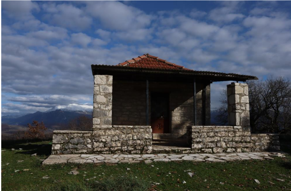
Agios Athanasios of Vissani - Άγιος Αθανάσιος Βήσσανης

At that time, they used the raw materials available on hand, like stone and wood.