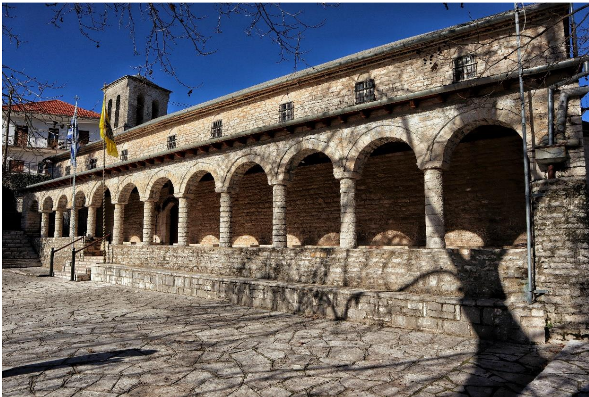
Saint Nicolas of Vissani - Άγιος Νικόλαος Βήσσανης

Each house is usually rectangular build, with one or two levels and is enclosed by a tall stone yard wall with a wooden gate. Which offered protection, in earlier times, against raiders and the harsh weather conditions.